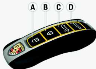
Fig. 76: Driver's key