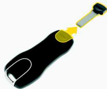
Fig. 77: Removing emergency key